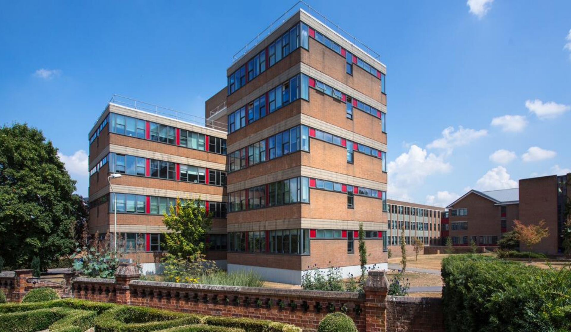
Edith Morley Building